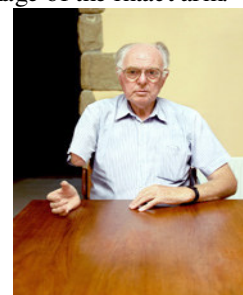
Fig. 3: The Phantom limb of this Amputee is perceived to resemble a hand disjointed from the elbow stump [24]

The mirror box illusion had quite dramatic therapeutic value for some people, but it was only moderately effective, or completely ineffective for others. For those that found it to be beneficial, it was possibly because the illusory phantom provides feedback that is consistent with actual phantom experiences. However amputees' perceptions of their phantom limbs often differ greatly from their original limbs [24]. The phantom limb can be shorter, or longer, vary in thickness, have gaps or be continuous, in comparison to the original limb. It is not unheard of for a phantom limb to be disconnected from the amputee's stump (See Figure 3). This is one reason why the mirror box illusion does not have any therapeutic value in some cases, as it is not uncommon for the reflected image to bear no resemblance to the phantom limb perceived by the amputee. These irregularly shaped phantoms cannot be viewed in the mirror, as it necessarily reflects the image of the intact arm.