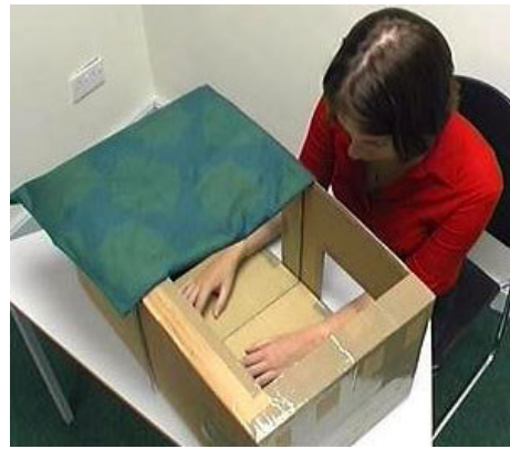
Fig. 2: Demonstrating the Mirror Box Illusion

V.S. Ramachandran developed a technique to treat phantom limb pain in upper limb amputees by using an ordinary mirror [23]. The box is made by placing a vertical mirror inside a cardboard box with the roof of the box removed. The front of the box has two holes in it, through which the subject inserts his/her good arm and the phantom arm. (See Figure 2) When viewed from slightly off-centre, the reflection of their "good" arm gave the impression that the subject had two intact arms. By sending motor commands to the intact arm to make symmetric movements, as if conducting an orchestra, it gives the impression that the phantom arm has resurrected and the subject receives positive visual feedback informing the brain that the phantom arm is moving in synchrony. This process has been dubbed the Mirror Box Illusion and is the main basis for this study.