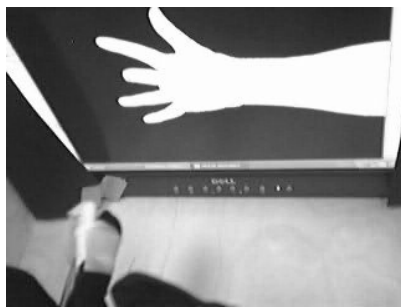
Fig. 5: Subject using the Augmented Reality Mirror Box, whilst data is being recorded

The participants were then fitted with the left-handed 5DT data glove. They positioned their left arm in front of the flat screen and their right arm behind it. An image of a right arm appeared on the screen. The image used here was a realistic 3-d representation of a human arm. The subjects were instructed to keep their eyes fixed on the image on the screen right throughout the experiment. The same experimental procedures as before were carried out, with the flat screen taking the place of the mirror.